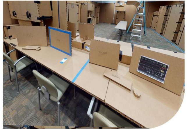
As part of the discovery process, our teams worked with our vendors to build full-size mock-ups using cardboard, tape and imagination, to help identify best work-flow and patient experiences. This is proving to be a vital and invaluable step in the planning.

In this remodeled space, we envision bringing together our interventional radiology and vascular programs, echocardiogram and stress testing, and an electrophysiology program into three state-of-the-art suites. We would create a space that is workflow friendly and welcoming for our patients. We know we can keep three labs busy every day of the year.